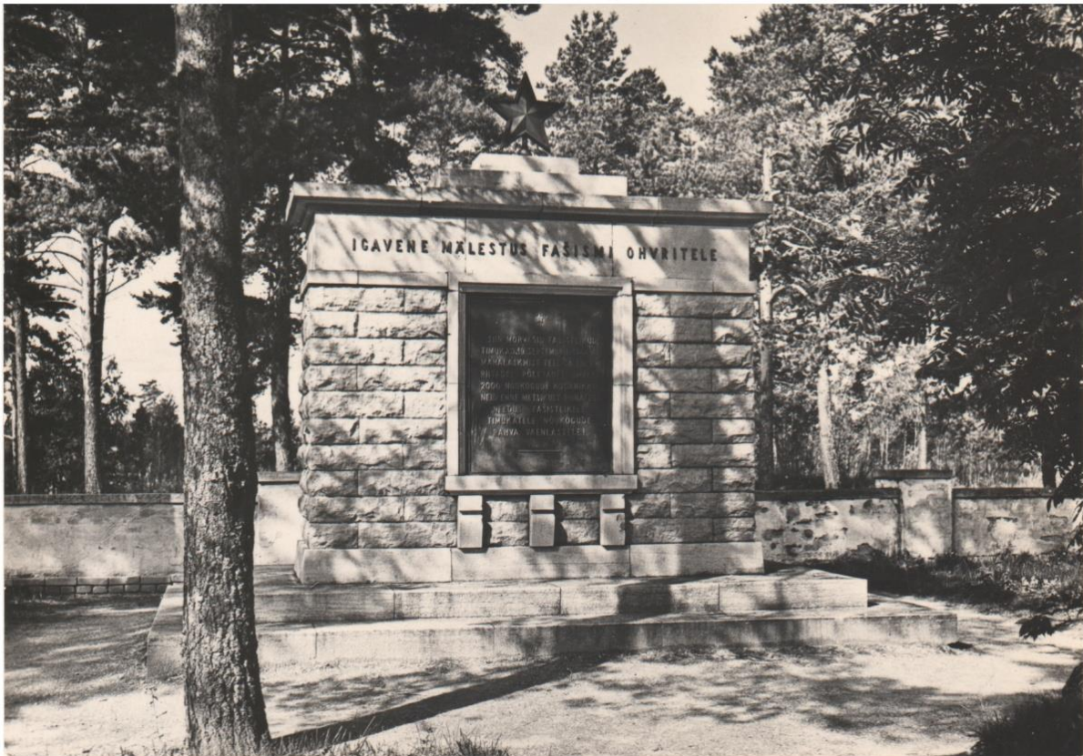
Soviet postcard with the first monument of the Klooga Memorial in 1965

Later plaques condemning the perpetrators of the massacre were fitted on the monument, they were called ‘fascist murderers’, and ‘enemies of the Soviet people’, while the victims were referred to as ‘Soviet citizens’. Still later plaques with information in Estonian and Russian were added, describing the Klooga concentration camp and the tragedy of 19 September, in the style of Soviet puritanism.