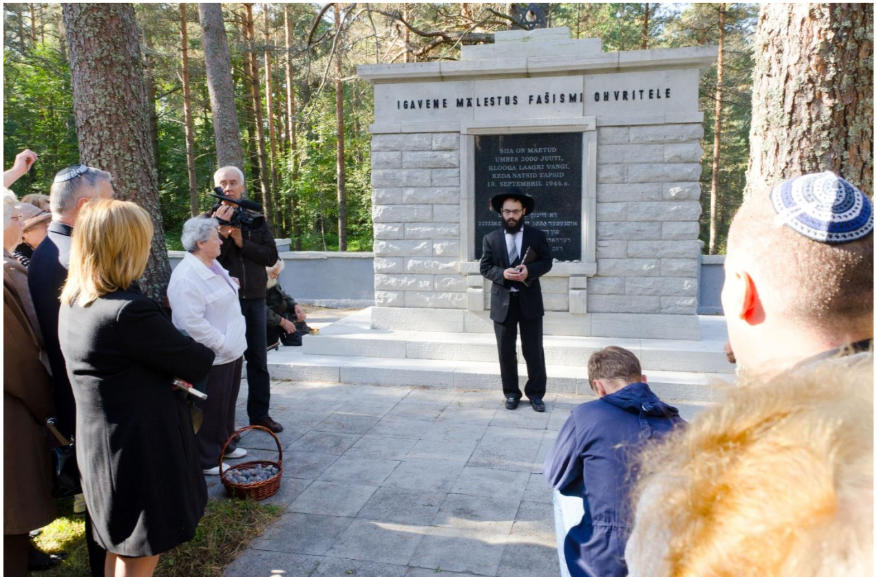
Opening ceremony of the exhibition “Klooga Camp and the Holocaust” on 3 September 2013. Estonian History Museum