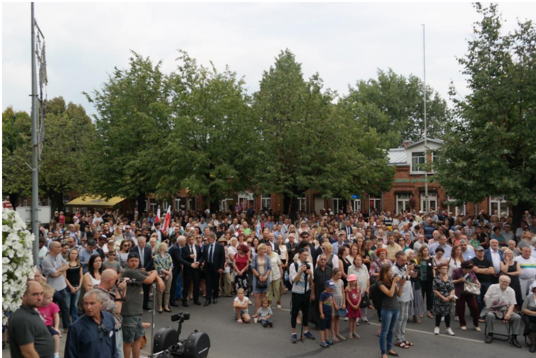
Participants of the commemoration event in Molėtai.

start crying because such moments are moving. Someone from among us and someone from among them. And that's enough. Just that, to show them and ourselves that we are no longer enemies." 6