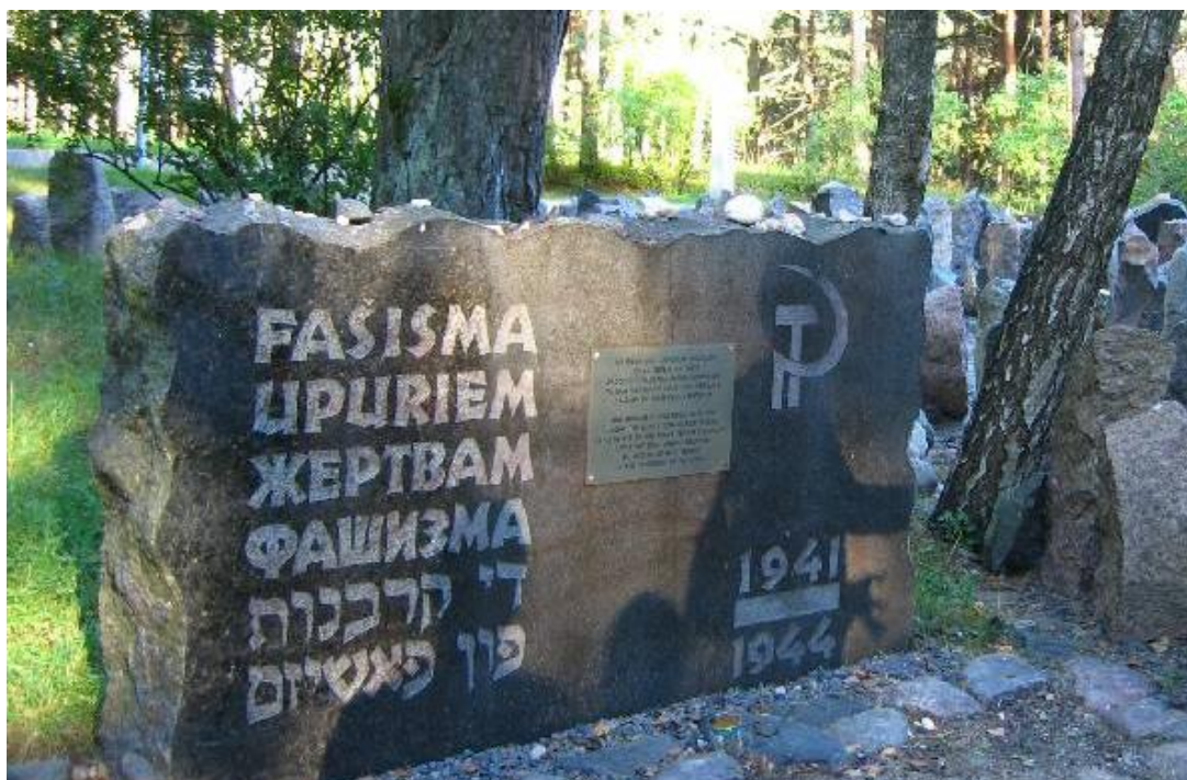
The first monument nowadays.

Every year since 1962, the Riga City Council organised ceremonies at Rumbula in line with the Soviet ideology and under control of the KGB. At these official ceremonies, an orchestra played military music and party members held speeches focusing on the various groups of people who had been killed here because they had been fighting against Fascism. Nobody talked explicitly about the Jewish victims. After these ceremonies, the Jewish activists stayed to sing Yiddish songs and a Caddish in memory of the murdered Jews. At these private meetings survivors talked about their experiences and sometimes Jews from other countries attended.