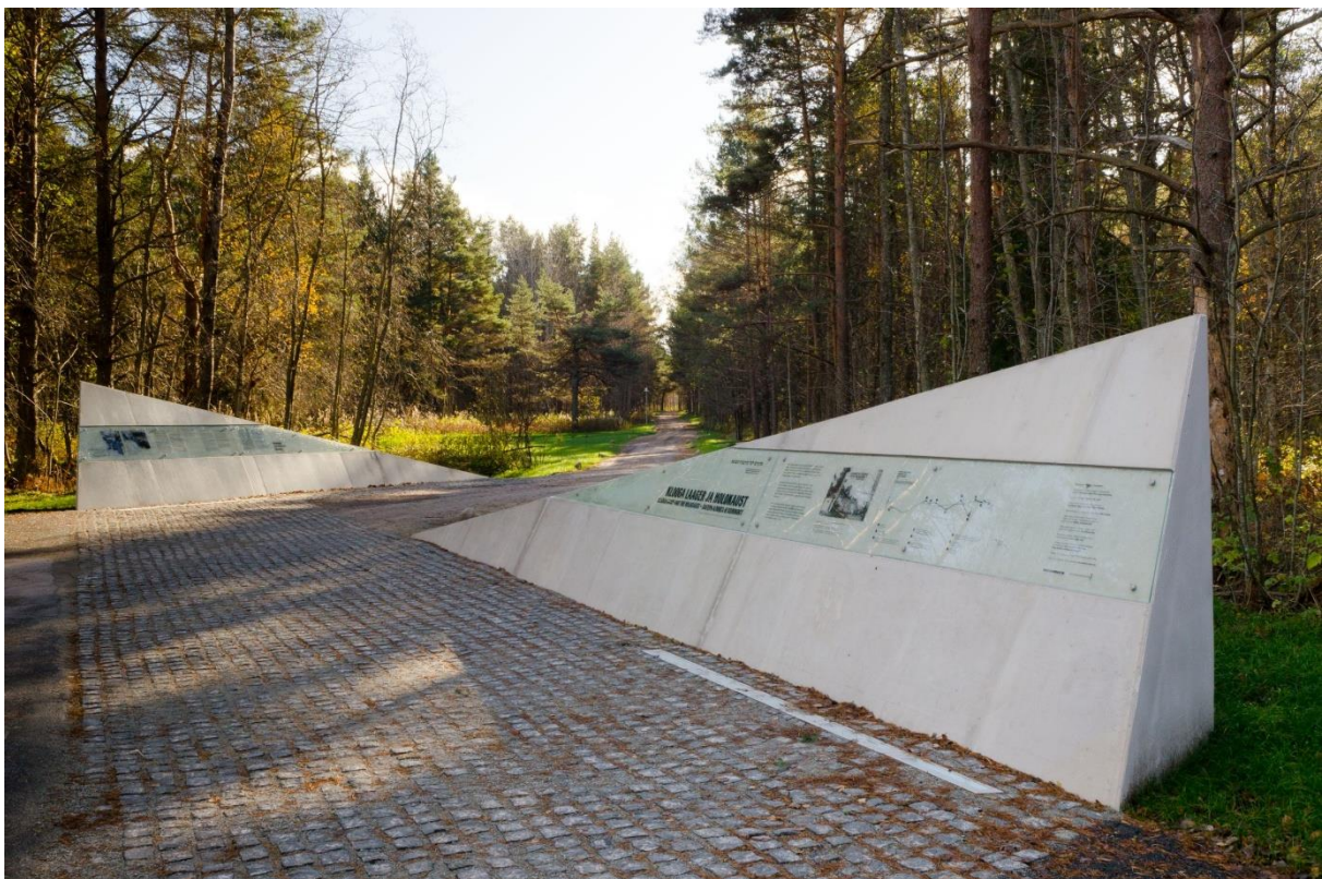
View of the concrete blocks with the exhibition "Klooga Camp and the Holocaust". Estonian History Museum

The Klooga memorial underwent extensive restoration in 2013, before the Estonian History Museum outdoor exhibition "Klooga camp and the Holocaust" was opened to visitors. The outdoor exhibition was prepared in cooperation with the Ministry of Culture and the Jewish Community of Estonia. The exhibition provides an overview of the Holocaust in Estonia and elsewhere in Europe as well as of the Klooga concentration camp, the massacre of 19 September 1944 and the commemoration of the victims. The huge concrete blocks with the exhibition texts symbolise the Klooga concentration camp – the prisoners manufactured, among other things, concrete elements for the German military industry. A number of concrete blocks, which merge with the landscape, form a unity with the individual monuments erected at different times, creating a modern, architecturally diverse and visitor-friendly environment.