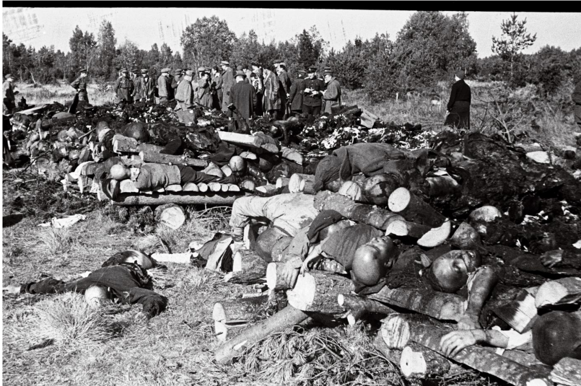
Pyres with burned bodies. Members of the extraordinary commission formed to investigate the mass murder in Klooga seen in the background are. September 1944.