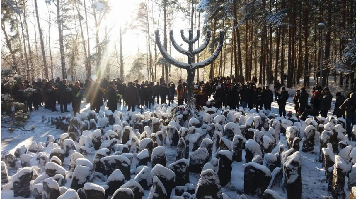
Remembrance ceremony at the Rumbula memorial, November 29, 2016. Didzis Bērziņš.

Even if the tragic events are well known in the society today, the forest is still sometimes connected to a different topic: Since Latvia has regained independence, the designation 'the notorious Rumbula' has been used in the media not to refer to the massive destruction of Jews, but to characterise low quality products and services in the car market in Rumbula.