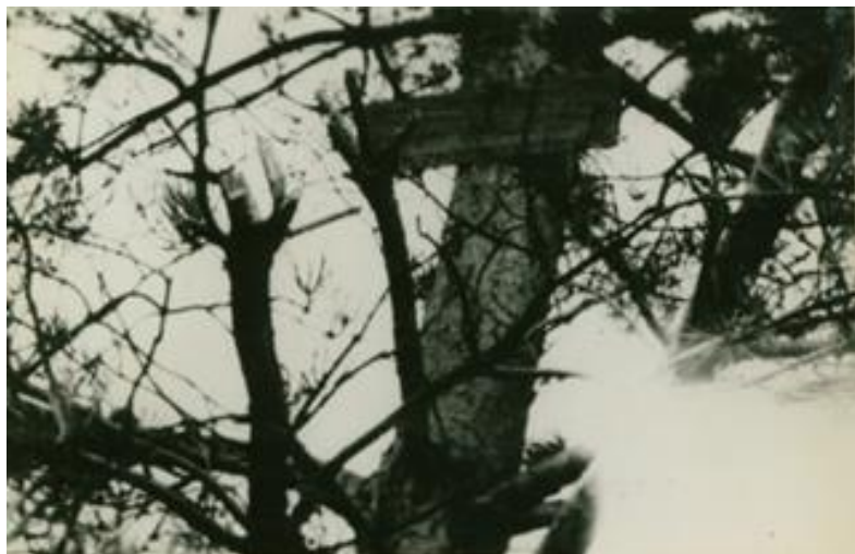
The first memorial plaque at Rumbula.