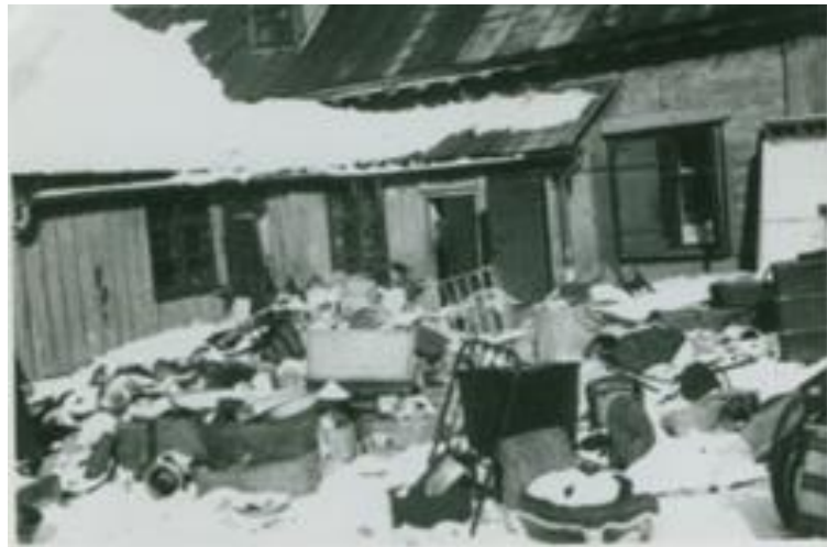
The Riga ghetto after the Rumbula „Aktion“. Staatsarchiv Hamburg, Best. 213-12 Staatsanwaltschaft Landgericht – Nationalsozialistische Gewaltverbrechen Nr. 0044 Band 034.

On November 30 th at 4:00 a.m. Latvian SD men rounded up the ghetto and forced people out of their houses. Jews were organised in columns of 1000 people and made to walk to the forest of Rumbula. The situation was chaotic and many Jews tried to hide or resist. They were shot immediately. About 800 people were killed on their way to the killing site, and later buried in the former Jewish cemetery, which at the time was part of the ghetto. After a having been forced to walk eight kilometres to Rumbula, the Jewish men, women and children had to undress and hand over their valuables. They were dragged in the ditches, 30 to 40 meters long and 10 meters deep, and forced to lie down on their compatriots who had been killed moments ago. Then they were shot in the back of their heads. The killing lasted until dawn. 13