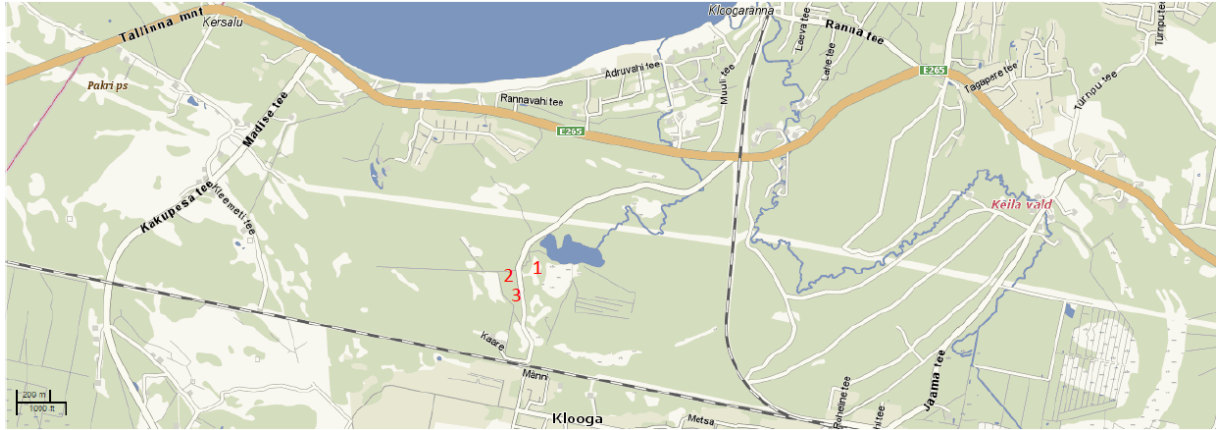
Site plan of the Klooga memorial monuments: 1) Monument to all Jews murdered in Estonia in 1941-1944. 1994. 2) Memorial stone on the gravesite of the victims of Klooga massacre. 1951. 3) Monument to all Jews who were killed or died in labour and concentration camps in Estonia between 1941 and 1944. 2005.

During the independence period Klooga memorial has been considerably expanded. On the eve of the 50th anniversary of the Klooga massacre, a monument to all Jews murdered in Estonia in 1941-1944 was erected about a hundred meters from the existing monument. This was the first monument in Estonia commemorating the victims of the Holocaust. A third monument was erected in Klooga in 2005 to commemorate all Jews who had been killed or died in labour and concentration camps in Estonia between 1941 and 1944. The memorial is located approximately 200 meters to the south of the prior monument to the victims of the Holocaust.